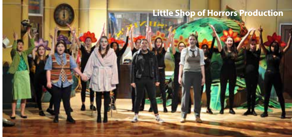
Little Shop of Horrors Production

Joining in the enrichment activities is part of the ethos of the Ursuline. The more your daughter participates and gives of herself, the happier and more successful she will be at school. Whatever your daughter's interests, she will find the opportunity to develop her talents and confidence through our Ursuline Enrichment programme.