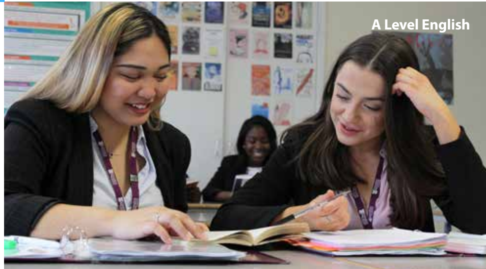
A Level English

Ursuline Sixth Form prepares students for University, Apprenticeships and for long term career progression. We foster and support independent learning skills, and provide specialist support in order to gain places on students' chosen pathways.