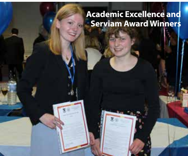
Academic Excellence and Serviam Award Winners

Ursuline High School is in the top 10% of schools nationally awarded for student progress and attainment. In 2018, 84.5% of students achieved five 9-4's including English and Maths (at Grade 4) in their Examination Results.