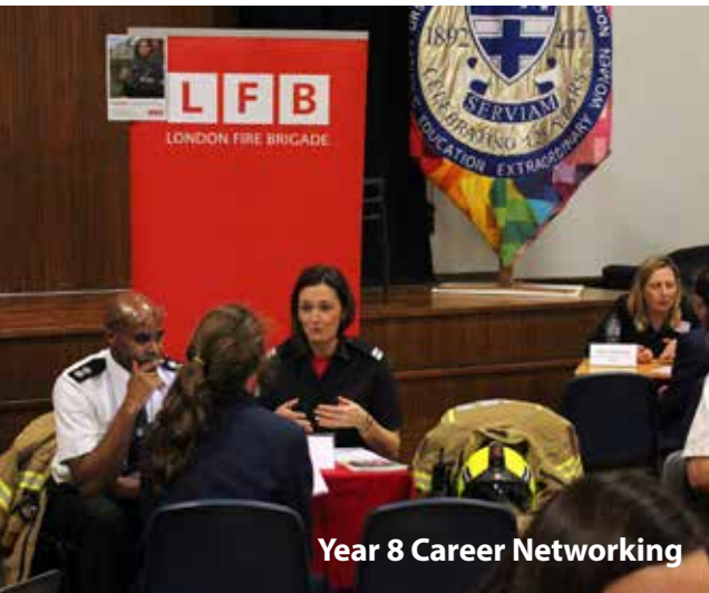
Year 8 Career Networking

We provide person-centred, impartial and confidential careers information. It is integrated into students’ experience of the whole curriculum and is based on a partnership with students and their parents or carers. We promote equality of opportunity, celebrate diversity and challenge stereotypes. (Our policy is guided by the Gatsby benchmarks identifying the elements of good practice in career guidance).