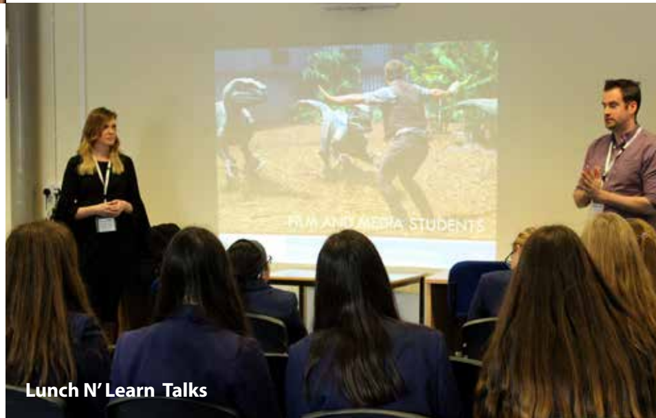
Lunch N’ Learn Talks

It is imperative that all students have encounters with employers, employees and experience the workplace. We are committed to prepare every student with knowledge and understanding of employability skills and their importance. We build on students’ teamwork, communication, investigative and adaptability skills and help prepare them for the world of work.