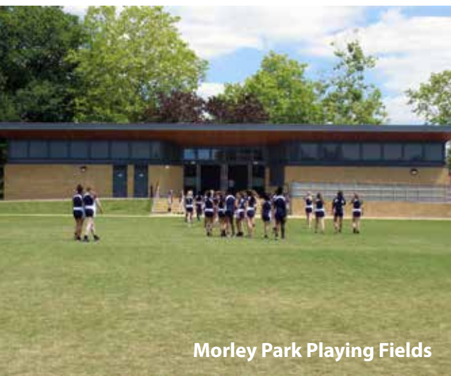
Morley Park Playing Fields

From specialist rooms for Food Technology lessons to ICT rooms for Computing and tranquil quad area (with outdoor seating) for chatting with friends at break-time, we have a campus which facilitates the optimum environment for learning.