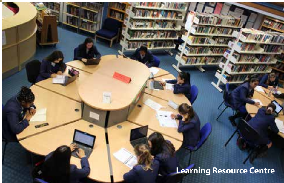
Learning Resource Centre

The brand new playing fields and pavilion at Morley Park are just a short walk from the school grounds and are available to students (for use during P.E. lessons and other sporting activities). The facilities include football pitches, changing rooms and an indoor space for wet weather conditions. We are pleased to have expanded our sport offering to include activities such as cricket and rounders. They are a wonderful addition to the school facilities.