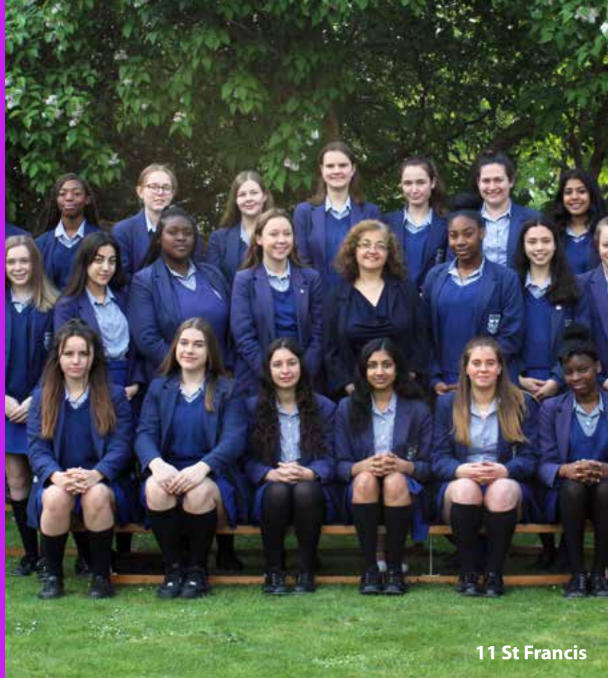
11 St Francis

There are 7 houses, each with a house colour which appears on the logo of the PE Kit shirt and on the House Captain's badge. Each form in Key Stage 3 nominates two House Captains who have roles and responsibilities for promoting and organising inter-form events with staff. House Captains receive the help and guidance of Sixth Form House Prefects and the School's House System Director.