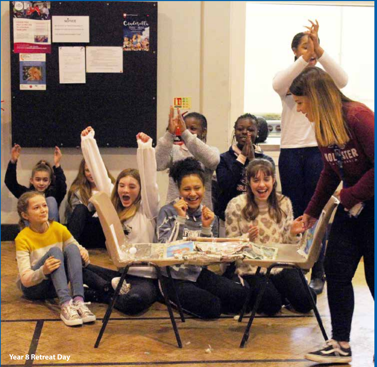
Year 8 Retreat Day