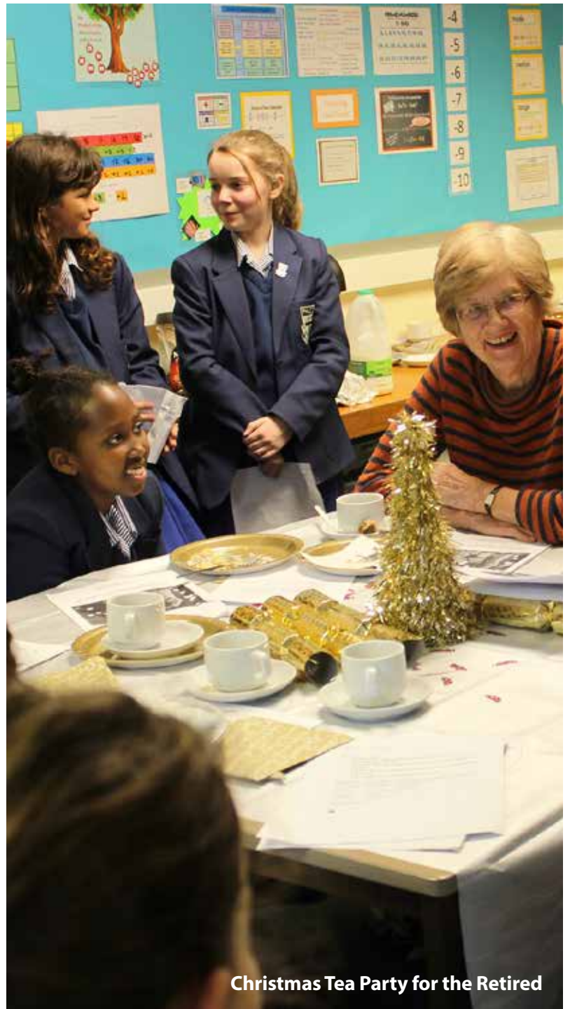
Christmas Tea Party for the Retired

Last year students raised money for charities. Local charities included; Homestart Merton and Children's Cancer . Internationally we have supported three schools; The Ursuline Tildonk School in the Democratic Republic of Congo, The Girls Technical School in Nigeria and The Women's Education Partnership in the Sudan. Students are encouraged to appreciate diversity and to build on the Gospel values of love, care, justice, peace, solidarity and respect.