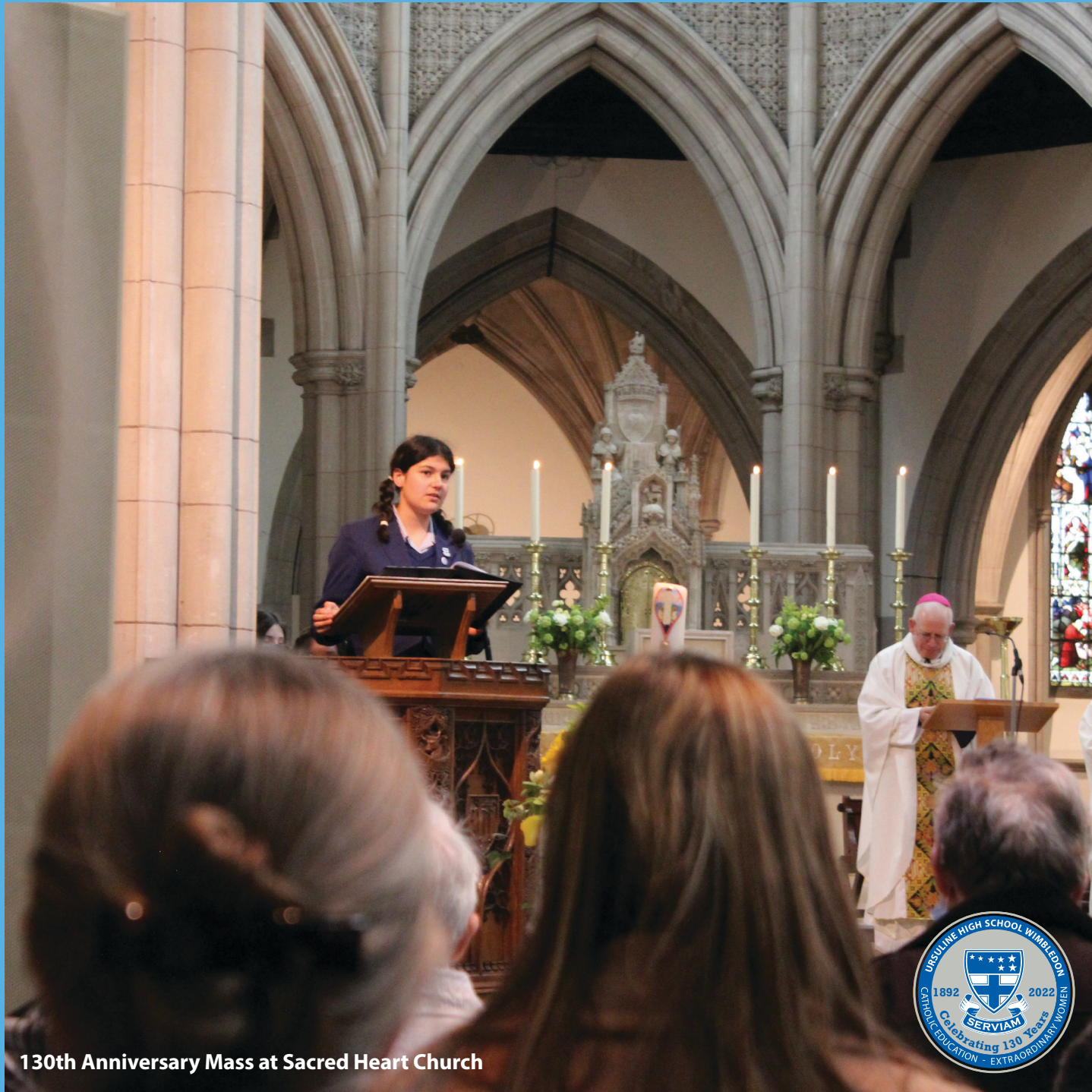
130th Anniversary Mass at Sacred Heart Church