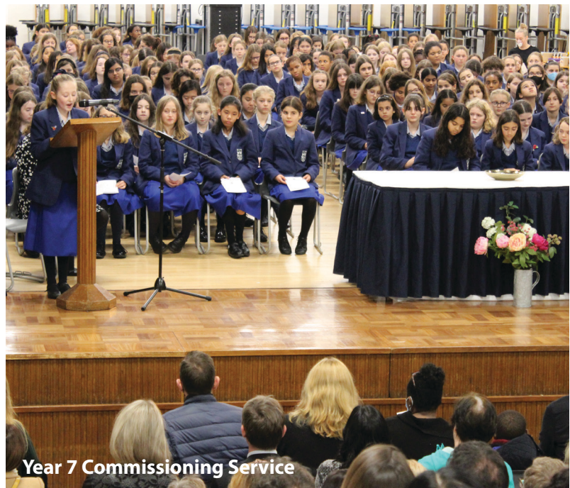
Year 7 Commissioning Service