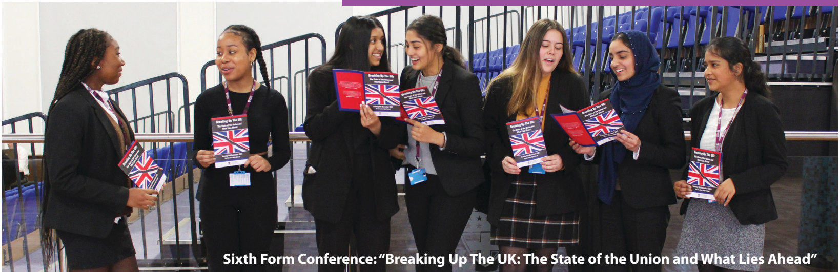
Sixth Form Conference: "Breaking Up The UK: The State of the Union and What Lies Ahead"

Extended learning enables all our students to understand the relevance of what they learn in their lessons to their future and gives them the knowledge, skills and motivation to succeed.