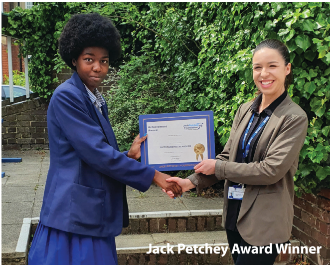
Jack Petchey Award Winner

Ursuline High School is in the top 10% of schools nationally awarded for student progress and attainment. In 2021, 93% of students achieved five 9-4's including English and Maths (at Grade 4) in their Examination Results.