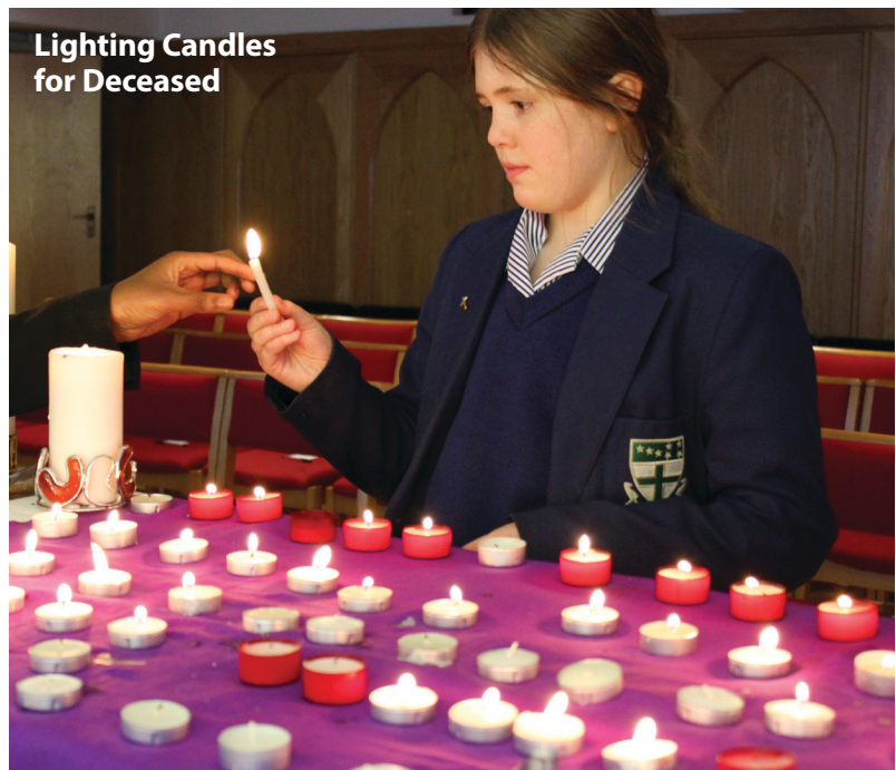
Lighting Candles for Deceased

Students have raised money for local charities including; Catholic Children's Society, The Poppy Appeal, Breast Cancer Now, Born Too Soon, Billable Hour, Merton Dementia Action Alliance, the Natasha Allergy Research Foundation and also collected food for Wimbledon Food Bank. Examples of our support internationally includes; Disasters Emergency Committee, CAFOD and the Ursuline Sisters in Ukraine. Students are encouraged to appreciate diversity, and to build on the Gospel values of love, care, justice, peace, solidarity and respect.