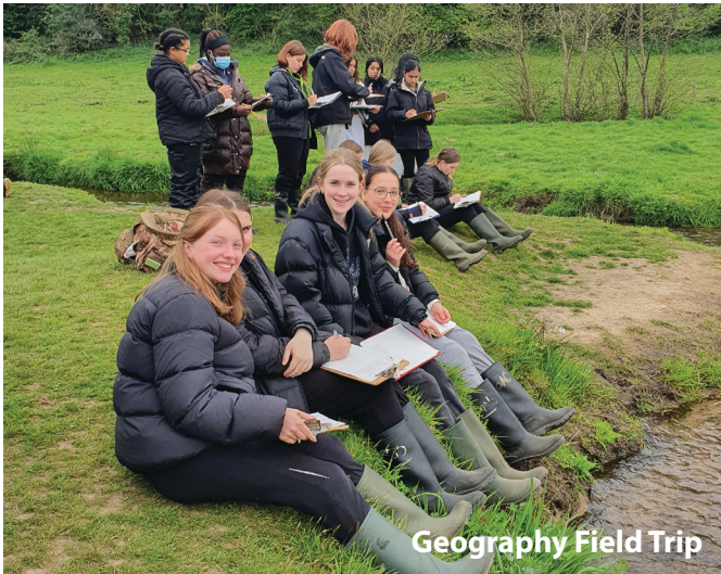
Geography Field Trip

We achieve outstanding results at Ursuline High School through challenging, engaging and consistently memorable learning experiences.