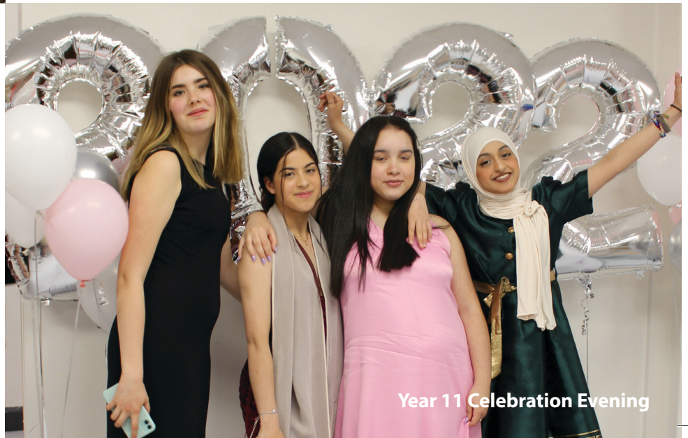
Year 11 Celebration Evening

Ursuline High School loves to reward success, we have celebration events for every year group where students are commended individually for their achievements!.