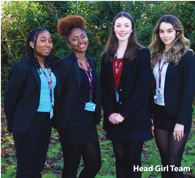
Head Girl Team

"Leadership is part of our everyday routine, it creates confidence in every student so we can excel in all areas of life beyond the classroom."