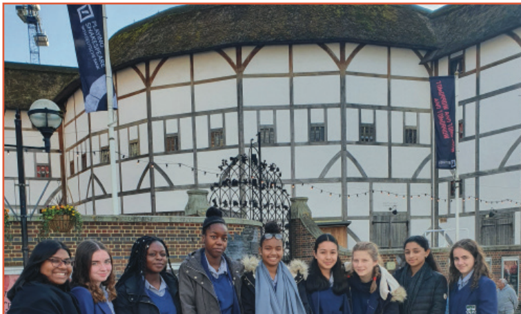
Year 9 students recently went on a trip to the Globe theatre in London. The group went to see Macbeth as part of their GCSE English preparation. They loved the drama and atmosphere in the Globe and it brought the work of Shakespeare to life!