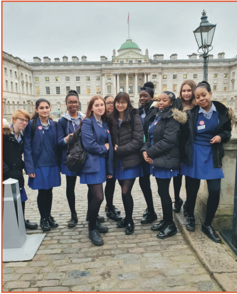
Year 10 students had a wonderful visit to King's College London in March, where they had a real insight into life as a university student. The group had a tour by current students and got to attend a lecture on law.