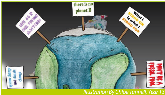
Illustration By Chloe Tunnell, Year 13