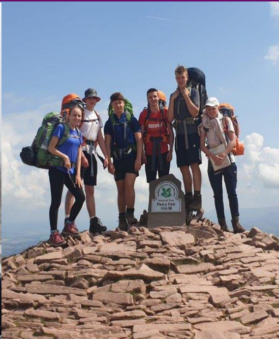
DofE Gold Award