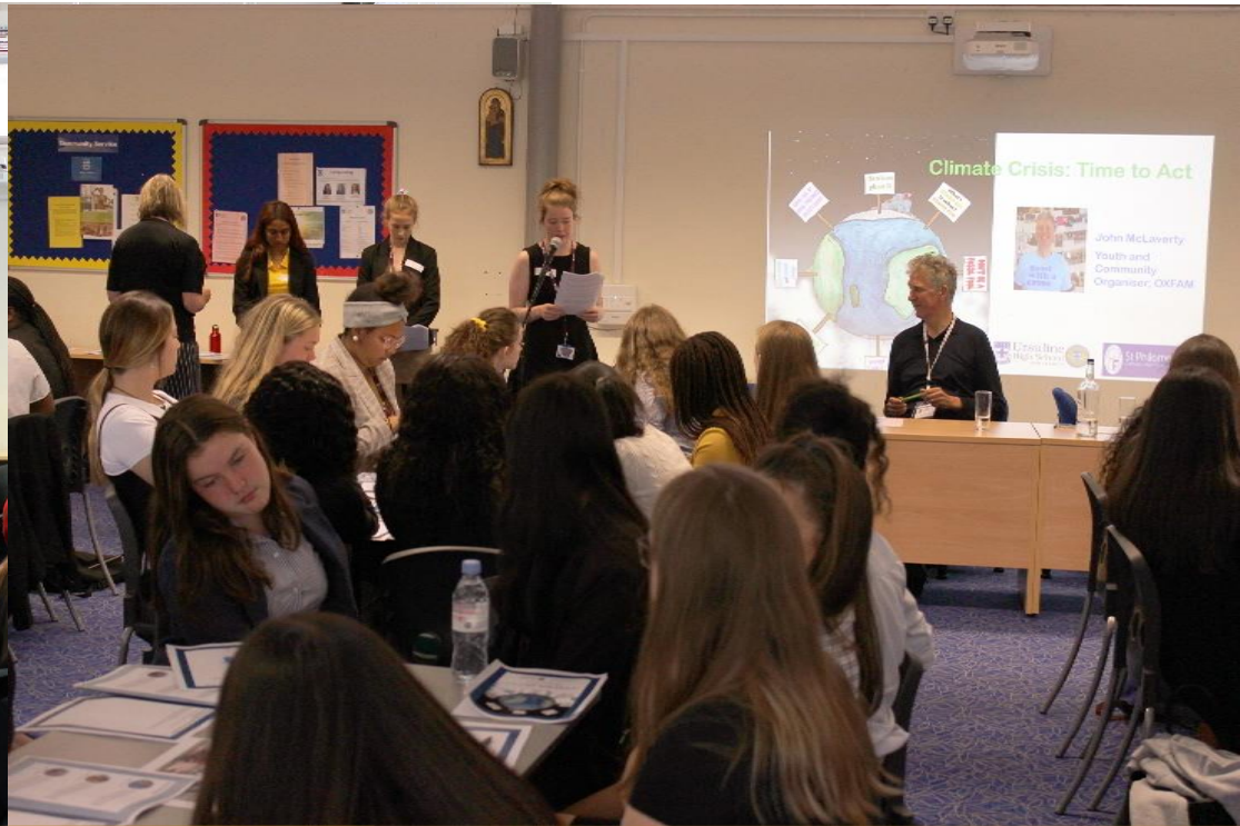
Climate Change; Time to Act Conference