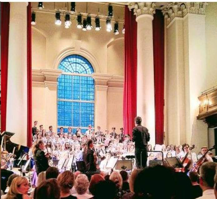
St John Smith Square