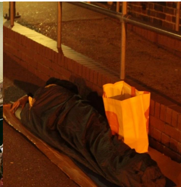
Sixth Form Homeless Sleepout