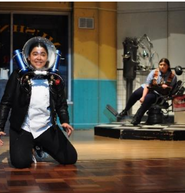
Little Shop of Horrors