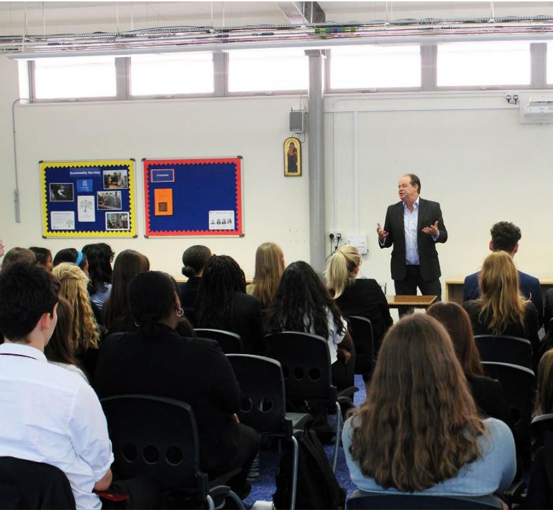
Stephen Hammond MP Business and Economics Brexit Talk