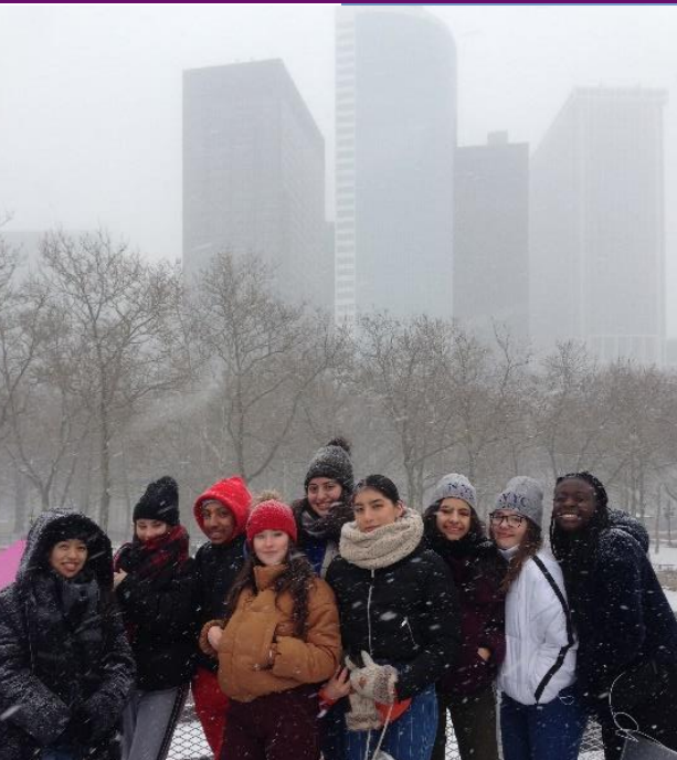
New York Trip