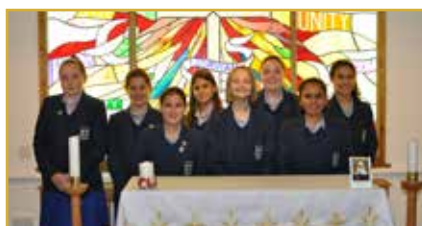
Year 8 Chaplaincy Team Chaplaincy teams for the year have now been selected. Looking forward to hearing about their good work!