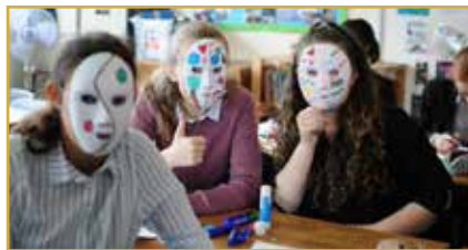
Year 12 creating 'Who Am I' Mask's during Faith Development Day