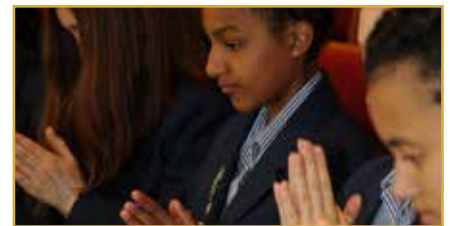
Masses have been held for both the Holy Spirit and St Ursula this half term