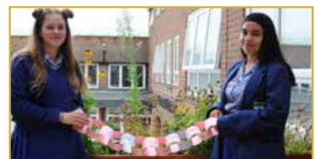
On Thursday 21st September we held peace prayer to mark World Day of Peace & created a 'peace chain'.