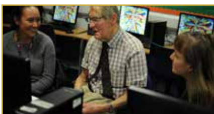
Silver Surfers I.T Clinic takes place on Friday afternoons in DK block, more learners always welcome. Please contact the school for details.