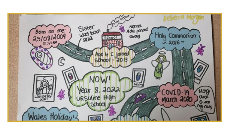
Year 8 and 9 Chaplaincy Team Celebration