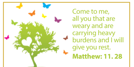
Click here to find out more about the Catholic Mental Health Project