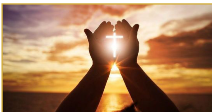
Click here for some options of online spiritual support at this time