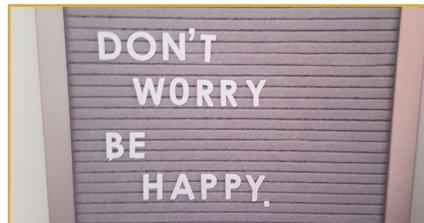
Positive message board by a student in Year 7.