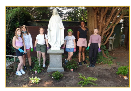
Eco-Committee Gardening Project