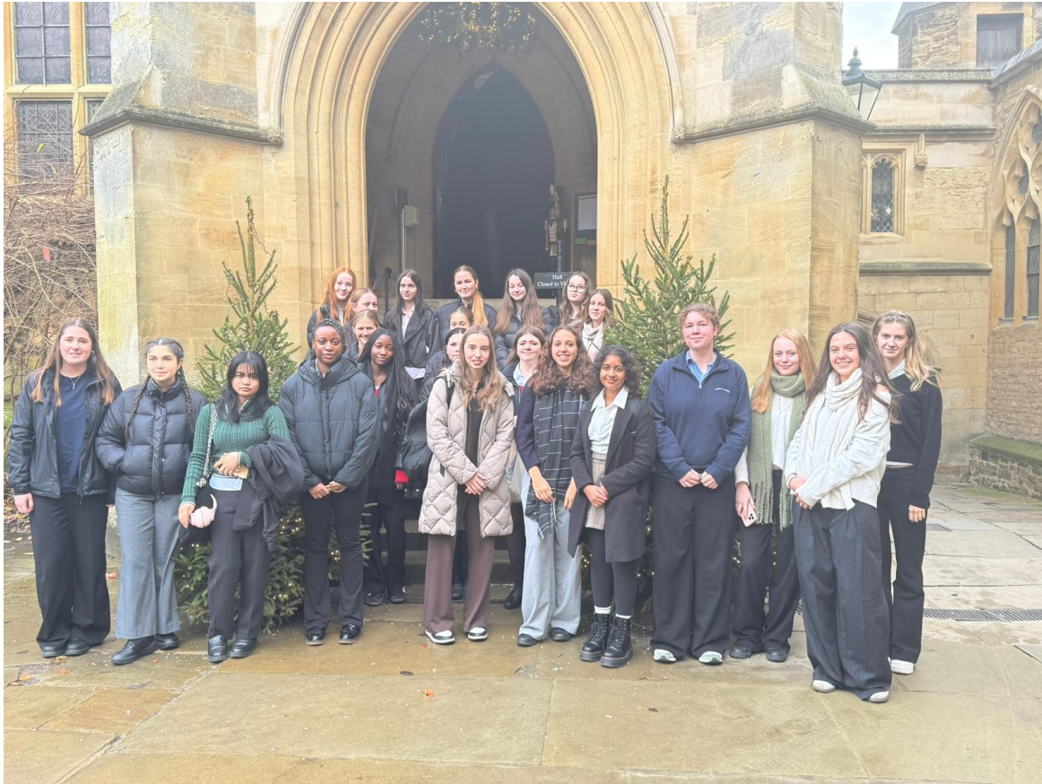
Year 12 Ursuline Global Scholars participated in global meeting hosted by Ursuline New Rochelle in New York this week.

020 8255 2688 / www.ursulinehigh.merton.sch.uk