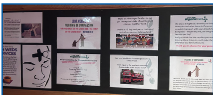
Students decorated the Chapel display board with Lenten themes, offering a space for spiritual reflection during breaks.