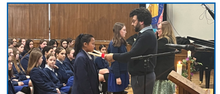
Ahead of St Blaise's feast , our choir received the blessing of throats and shared testimonials on the role of music in their faith.