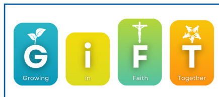
GIFT after-school faith sessions continue to be well attended, providing students with opportunities for prayer, reflection, and social time.