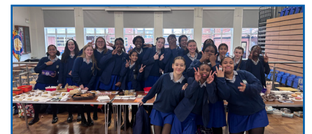
The Chaplaincy Team hosted a Bake Sale to raise funds to help offset costs of a residential team retreat. They raised £200.