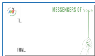
Our Messengers of Hope initiative encouraged students and staff to exchange postcards of encouragement.