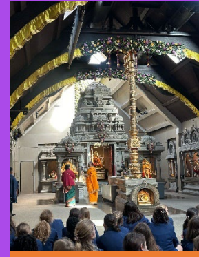
Shree Ghanapathy Hindu Temple