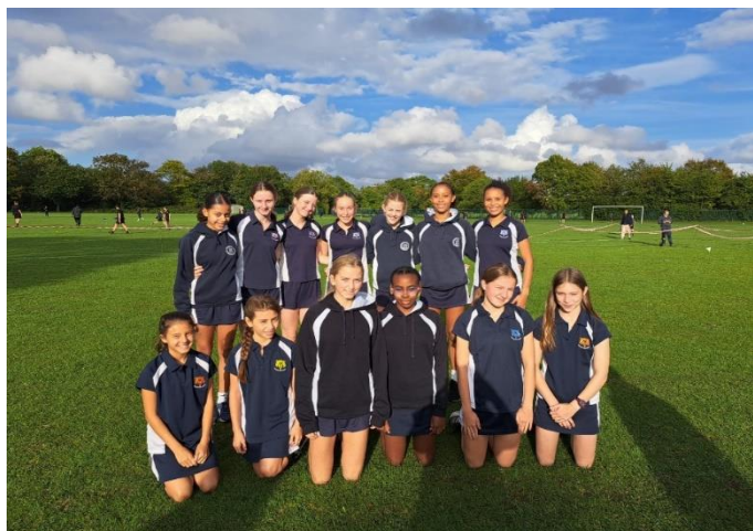
Cross Country team out at the Merton trials for Surrey schools on Monday

Crescent Road, Wimbledon, London SW20 8HA 020 8255 2688 / www.ursulinehigh.merton.sch.uk