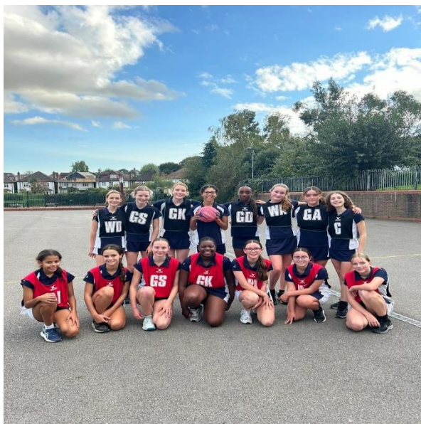
Year 9 Netballers competing at St Cecelia's. A team winning 23-24 and B team losing 13-6

Crescent Road, Wimbledon, London SW20 8HA 020 8255 2688 / www.ursulinehigh.merton.sch.uk