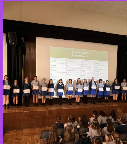
Achievement Subject Awards