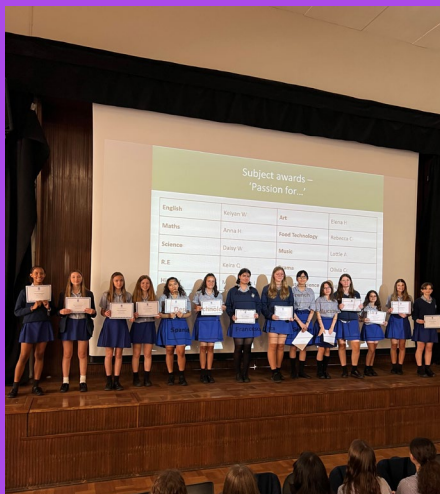
Passion Subject Awards