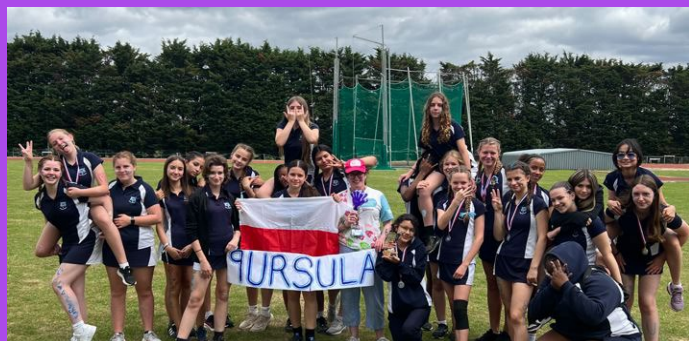
GO URSULA – Form winners of this year's sports day!

*Please note this is not a complete event list and is intended to provide a snapshot only. Events may be subject to change.