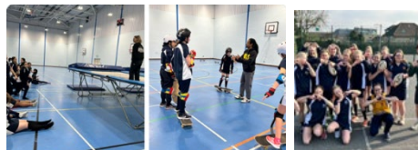
Friday afternoon fun- trampolining, skateboarding and rugby.