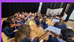
St Cecilia Concert