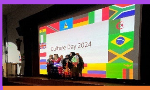
Multicultural Evening & Culture Day