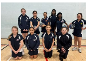
Year 7 Basketball team