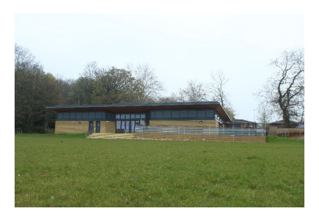
Our fantastic modern pavilion at Morley Park has become available for hire, see Morley Park Playing Fields Lettings for further details.