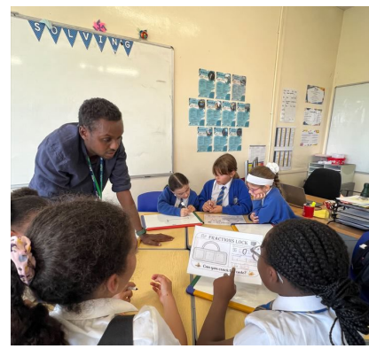
Local primary schools paid us a visit to take part in a STEM Day with Biology, Chemistry, and Maths departments today.