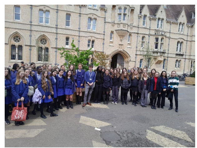
Year 10 and 12 students attended Balliol College, Oxford, for a campus tour and talk on Tuesday 14th May.