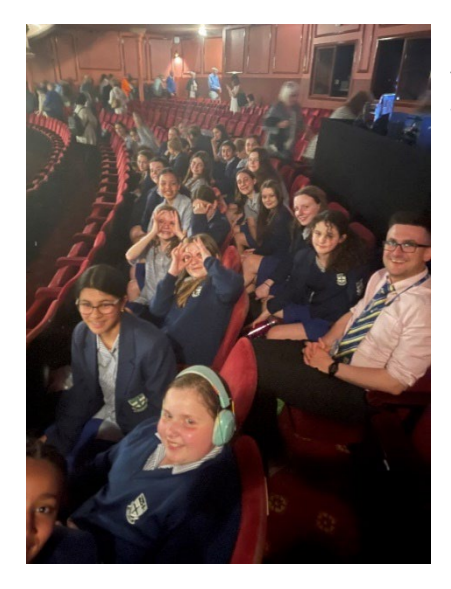
Year 7 & 8 Trip to see Jesus Christ Superstar at Wimbledon Theatre on Wednesday 15<sup>th</sup> May.

Crescent Road, Wimbledon, London SW20 8HA 020 8255 2688 / www.ursulinehigh.merton.sch.uk