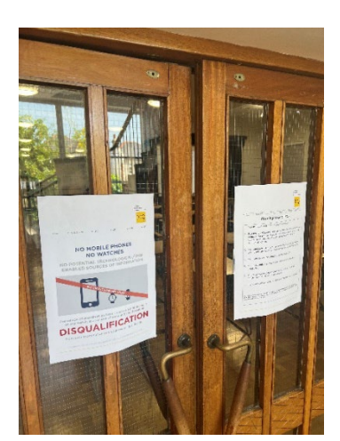
GCSE's have started this week and Year 11 have benefited from a smooth and focused start to their exams, we pray this continues. Wishing them all the best of luck!