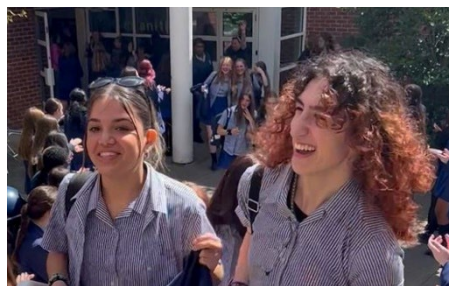
Year 11 Clap Out: Year 11 being clapped out of school by Year 7 and 10 as they entered GCSE Exam season.