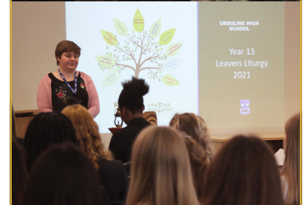
Year 13 Liturgy- celebrating and sending forth.