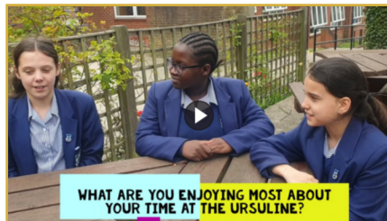
The 129th anniversary of the school, celebration video.