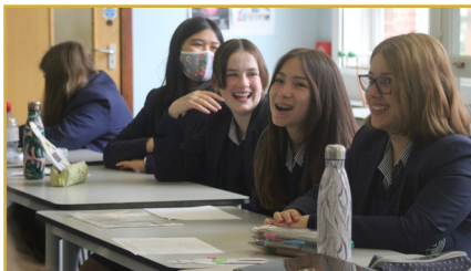
Year 9 Retreat- on the theme of 'Human Dignity'.