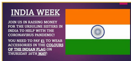
India Week- Fundraising for the Ursuline Sisters to assist with COVID-19