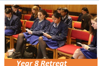
Year 8 Retreat