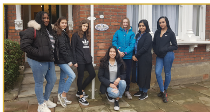
Year 9 Residential to Desenzano House