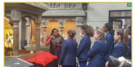
Hindu Temple Visit