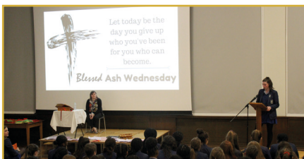
Ash Wednesday Services