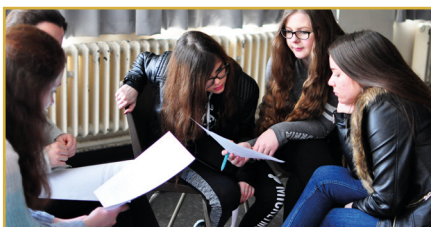
Year 10 Retreat Day