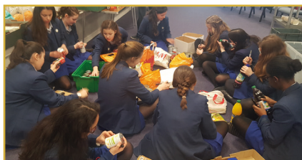
Lent Food Bank Collection