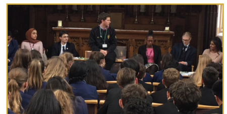
Generations Together Forum at Wimbledon College