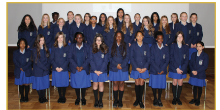
Year Commissioning Service