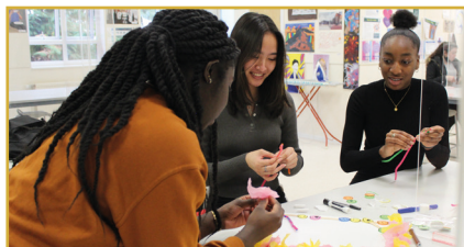
Year 13 Faith Day