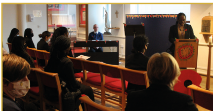
Online Remembrance Service