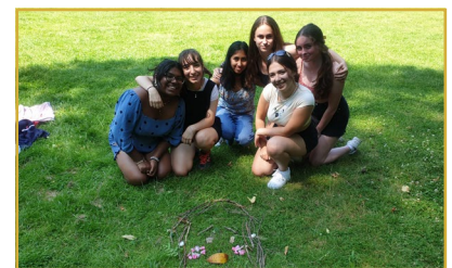
Refection Walk as part of UHS Fest