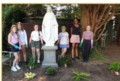
Eco-Committee Gardening Project