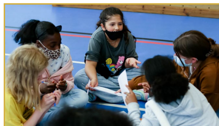
Year 7 Retreat - on the theme of 'Human Dignity'.