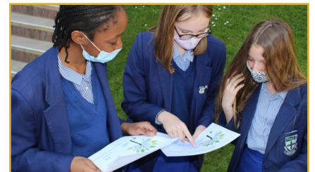
Ursuline Gives Thanks Cards.