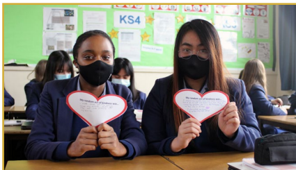
My Random Act of Kindness