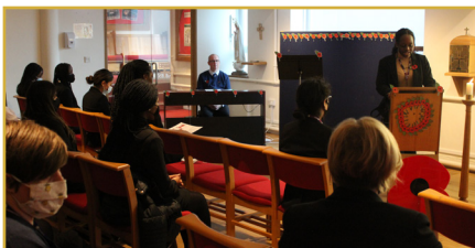
Online Remembrance Service