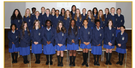
Year Commissioning Service