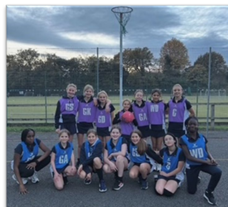
Year 7 are the Borough Netball Champions!