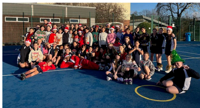
46 students enjoyed our festive inter-house Netball competition, well done to the overall winners 7 Ursula with 28 points, closely followed by 7 Francis with 26 points and 7 Teresa with 22 points – well done to everyone who took part!