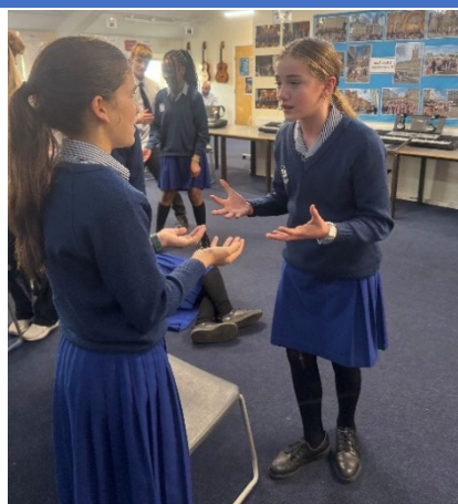
Community Production rehearsals are well under way.