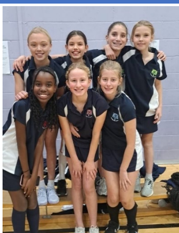
Year 7 Athletics team are Borough Champions, now off to the London Youth Games!