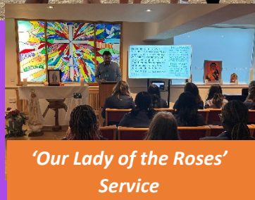
'Our Lady of the Roses' Service