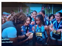
Erhumwusee (7M) with Joe Wicks