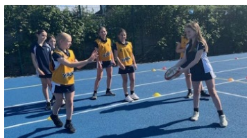
Harlequins Rugby Club

There have also been some other great achievements this half term, you can find these on our Instagram !