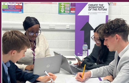
Our T Level Digital students loved their BIMA day. The BIMA Digital Day gave them an insight into a world of digital careers, and they had the chance to meet and work with digital experts.