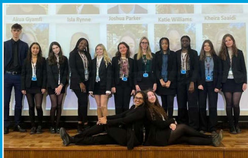
We had the most wonderful candidates speak at our hustings for the Head Team. We are blessed to have such wonderful leaders in the sixth form.