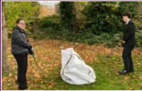
Year 12s students got outside taking part in a gardening project