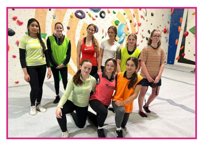
Excellent rock-climbing prep and final practice/training for moderation with our Year 11 GCSE PE climbers on 19th March at White Spider Climbing Centre.