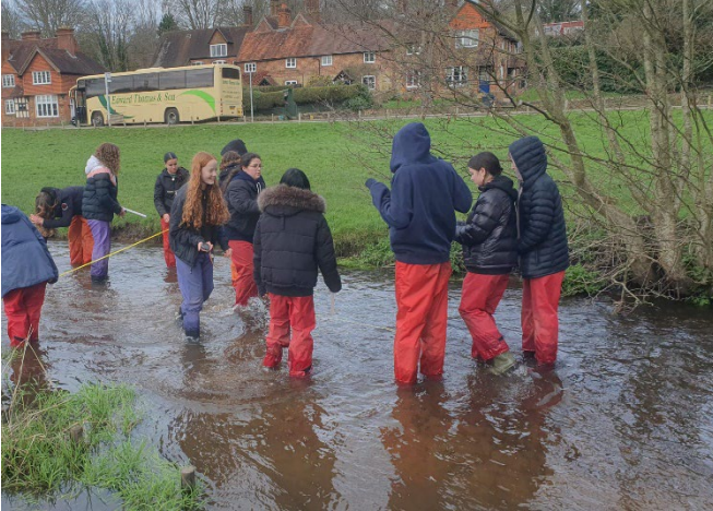
Year 10 Geography had a great time on their field trip to Juniper Hall in Surrey recently. They completed some river fieldwork as part of their GCSE unit.

Crescent Road, Wimbledon, London SW20 8HA 020 8255 2688 / www.ursulinehigh.merton.sch.uk