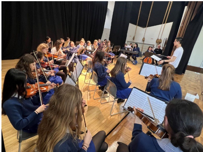
Our amazing orchestra performing at the St Cecilia’s Concert on Wednesday evening.