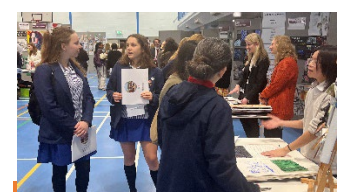
Sixth Form Open Evening