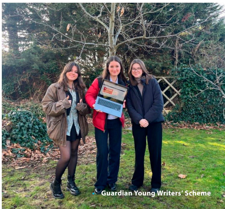
• Guardian Young Writers' Scheme