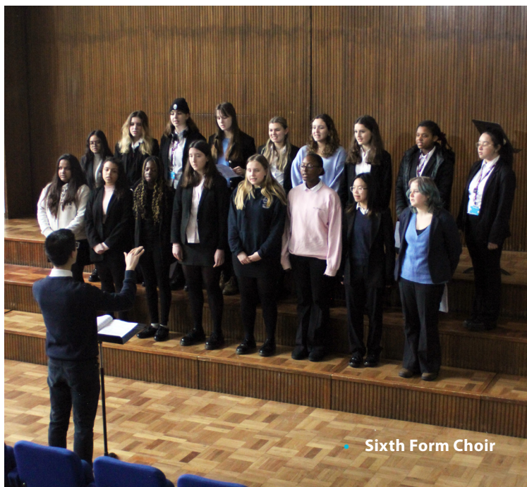
• Sixth Form Choir