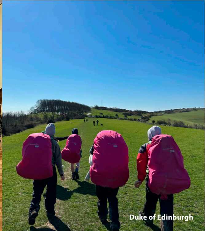
Duke of Edinburgh