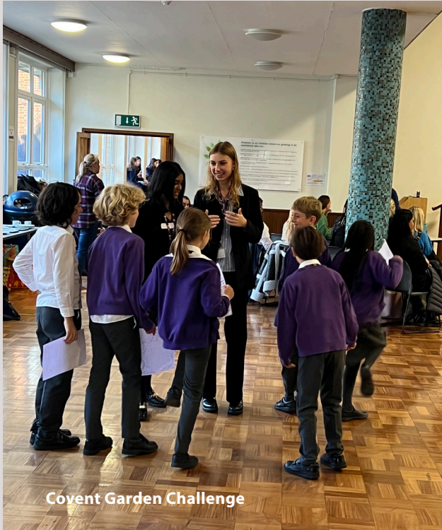
Covent Garden Challenge