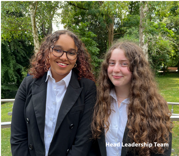
Head Leadership Team

Sixth Form students take a key role in Leadership across the school. Not only have they led on conferences with several distinguished guests but they are also involved in the school leadership through mentoring, chaplaincy work and the student buddy systems. A Head and Deputy Head Leadership team lead a team of senior prefects who are elected in Year 12. Leadership responsibilities include subject prefects and prefects for the community.