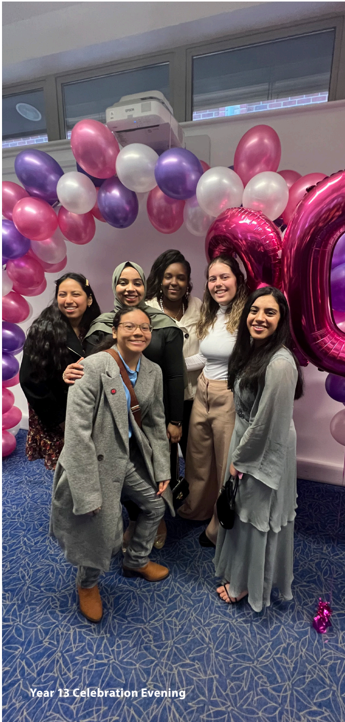
Year 13 Celebration Evening