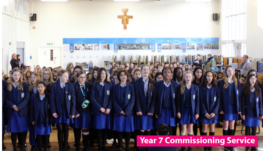
Year 7 Commissioning Service