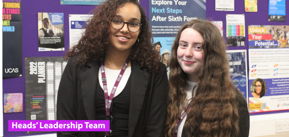
Heads' Leadership Team