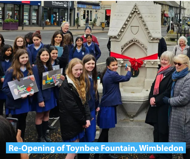
Re-Opening of Toynbee Fountain, Wimbledon

We are continuously forging and embedding links in the local, national, and international communities.