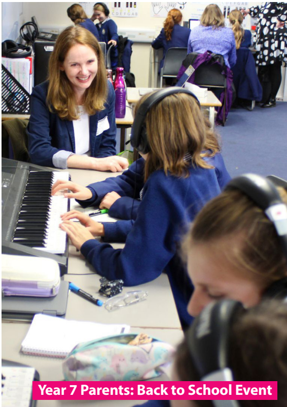
Year 7 Parents: Back to School Event

We need to collect items which can be used to generate money by way of raffle tickets. If you, or your company, can donate any form of gift, voucher, or ticket of entry in to places of interest/ events, or you are interested in joining our team, please contact us: UPA@ursulinehigh.merton.sch.uk