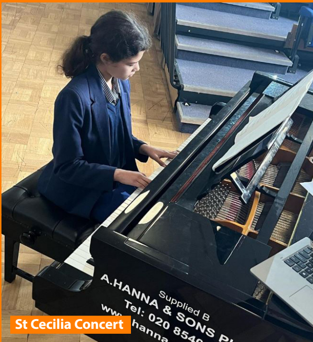
St Cecilia Concert