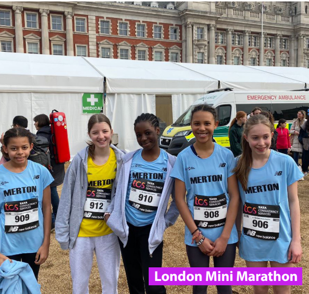
London Mini Marathon

With an all girls education students are more likely to take risks, for example putting their hand up in class, trying out for sports and performing arts.