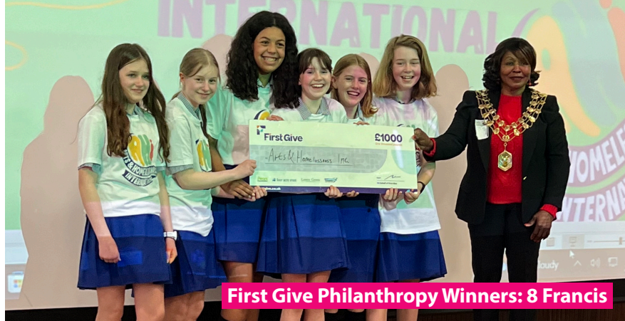
First Give Philanthropy Winners: 8 Francis

Students have raised money for local charities including; Catholic Children's Society, The Poppy Appeal, Breast Cancer Now, Born Too Soon, Merton Dementia Action Alliance, The Royal Marsden Hospital and also collected food for Wimbledon Food Bank. Examples of our support internationally includes; Disasters Emergency Committee, CAFOD and the Ursuline Sisters in Ukraine. Students are encouraged to appreciate diversity, and to build on the Gospel values of love, care, justice, peace, solidarity and respect.