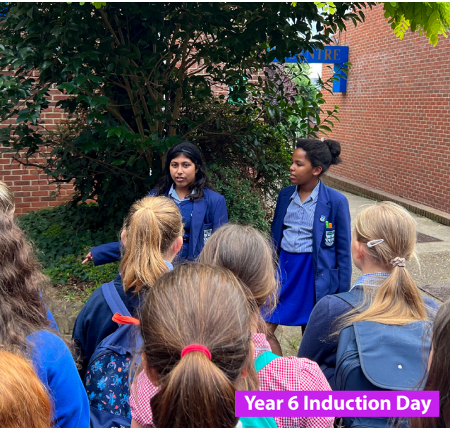
Year 6 Induction Day

"Leadership is part of our everyday routine; it creates confidence in every student so we can excel in all areas of life beyond the classroom."