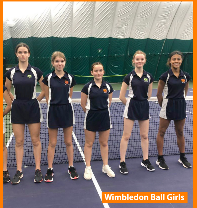
Wimbledon Ball Girls