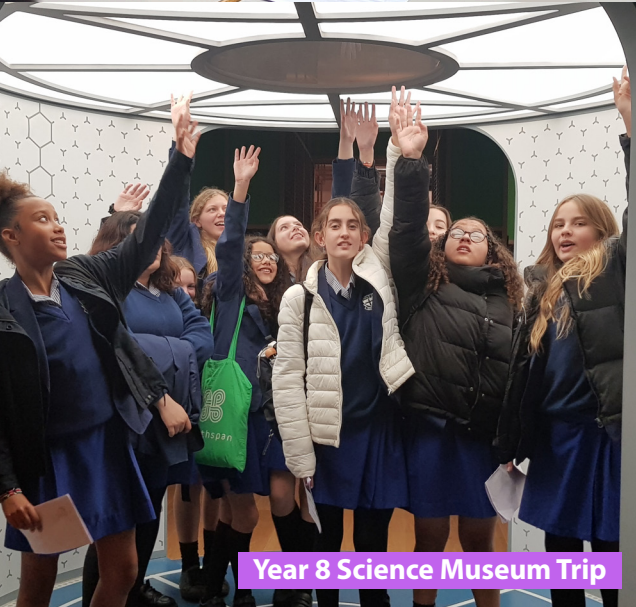
Year 8 Science Museum Trip

Our goal is to inspire our students to use their knowledge and skills to empower themselves to succeed academically and in the wider context of the world we live in through our broad and balanced curriculum. Our world class teaching and learning provision ensures that our students take pride in their achievements, engage with the learning, and succeed in their ambitions.