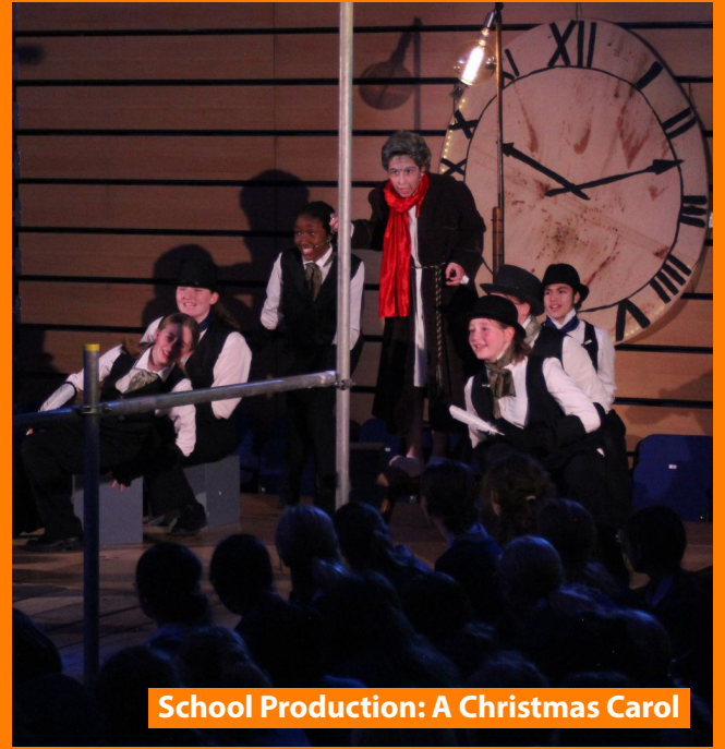
School Production: A Christmas Carol