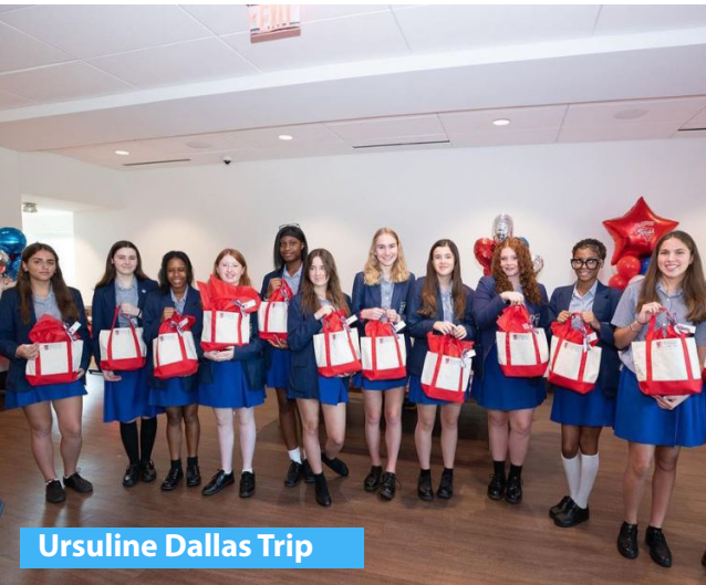
Ursuline Dallas Trip

At the Ursuline, our international links are key in enabling students to take on new challenges, learn from others and develop a broader understanding of the wider world around them.