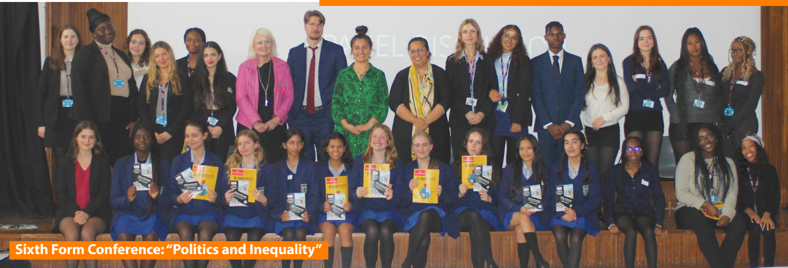
Sixth Form Conference: "Politics and Inequality"

Extended learning enables all our students to understand the relevance of what they learn in their lessons to their future and gives them the knowledge, skills, and motivation to succeed.