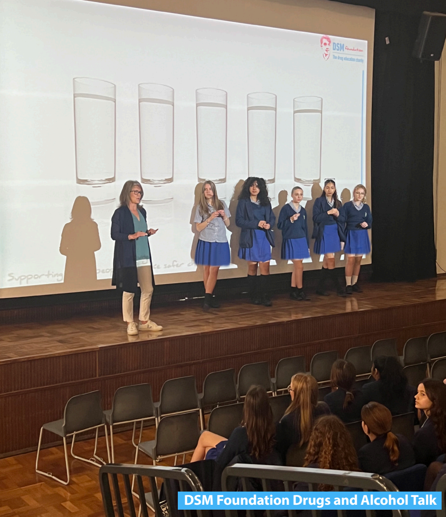
DSM Foundation Drugs and Alcohol Talk

“PSHEC aims to prepare students to be informed, engaged citizens, who can make physically, mentally, healthy and safe choices to thrive.”