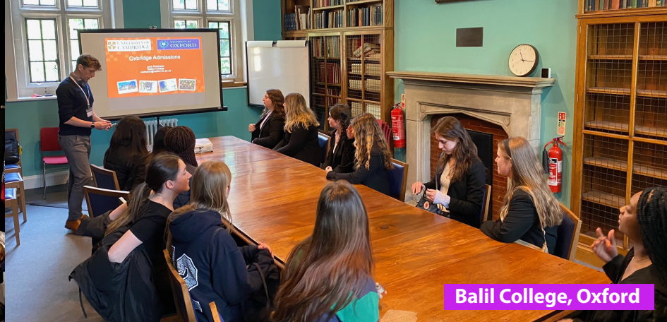
Balil College, Oxford