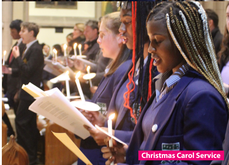
Christmas Carol Service