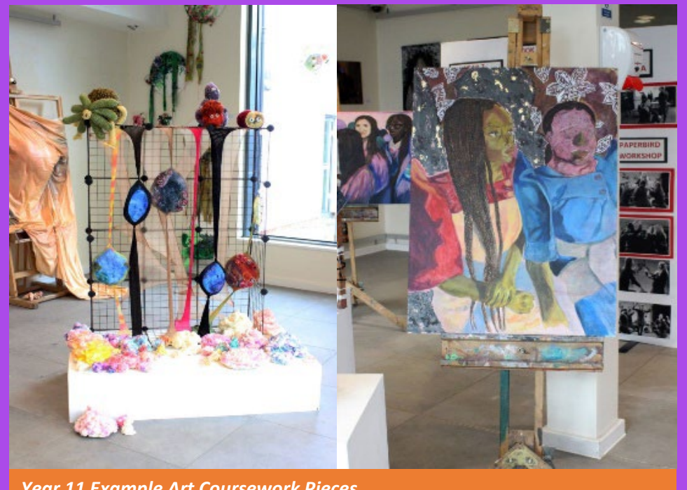
Year 11 Example Art Coursework Pieces

*Please note this is not a complete event list and is intended to provide a snapshot only. Events may be subject to change.