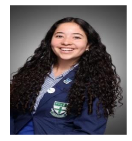
Welcome - Ursuline Education Network (ursuline-education.com)

Year 11 Mock Modern Foreign Language orals got underway this week. Students really value the fact that they get three full Mock practices in this discipline which really helps deliver the outstanding results for our students. The Ursuline is in the top 2% of schools nationally for its Language results and it is down to the collective effort of our staff and students that this is achieved and sustained. Well done.